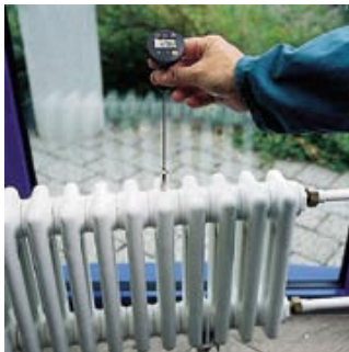
Servicing electrical products (cooking surfaces, irons, radiators)