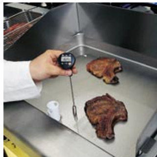
Checking hot plates in the catering industry