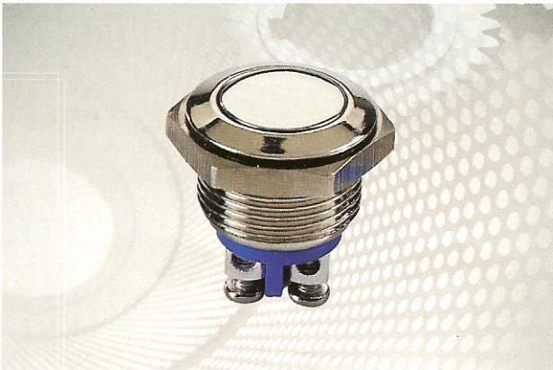
平圆形flat round head