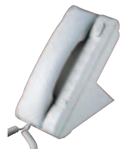
Ref. 1132/1 Ref. 1132/1